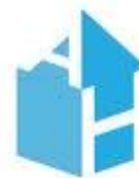
Students designed their own logo