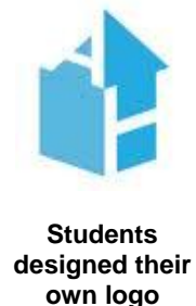
Students designed their own logo